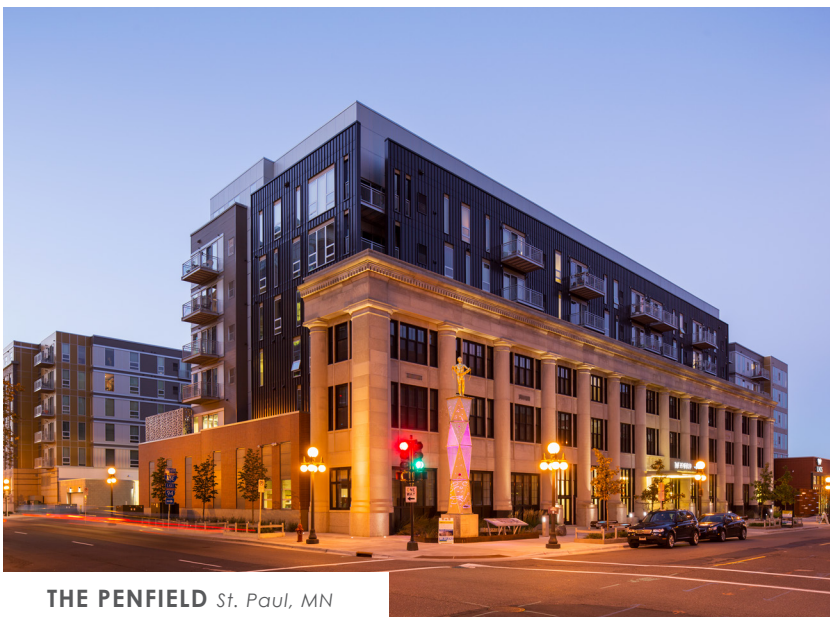
THE PENFIELD St. Paul, MN

The construction assemblies for renovation projects can take on numerous characteristics to provide noise mitigation and sound attenuation measures. BKV works closely with acoustic consultants to design cost effective and successful performance-based construction assemblies while maintaining the original characteristics of the historic structure. We continually investigate ways to improve the construction techniques for floor assemblies, roof assemblies, party walls and corridor walls.