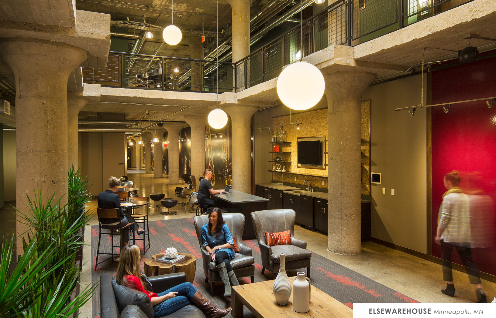
ELSEWHEREHOUSE Minneapolis, MN