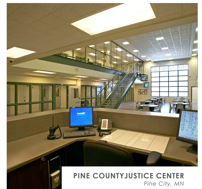
PINE COUNTY JUSTICE CENTER Pine City, MN