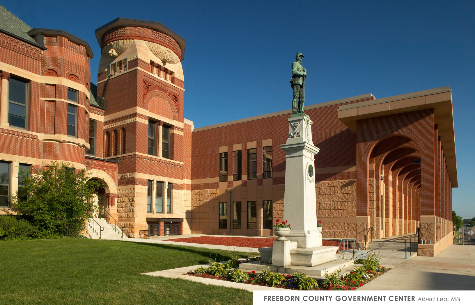
FREEBORN COUNTY GOVERNMENT CENTER Albert Lea, MN