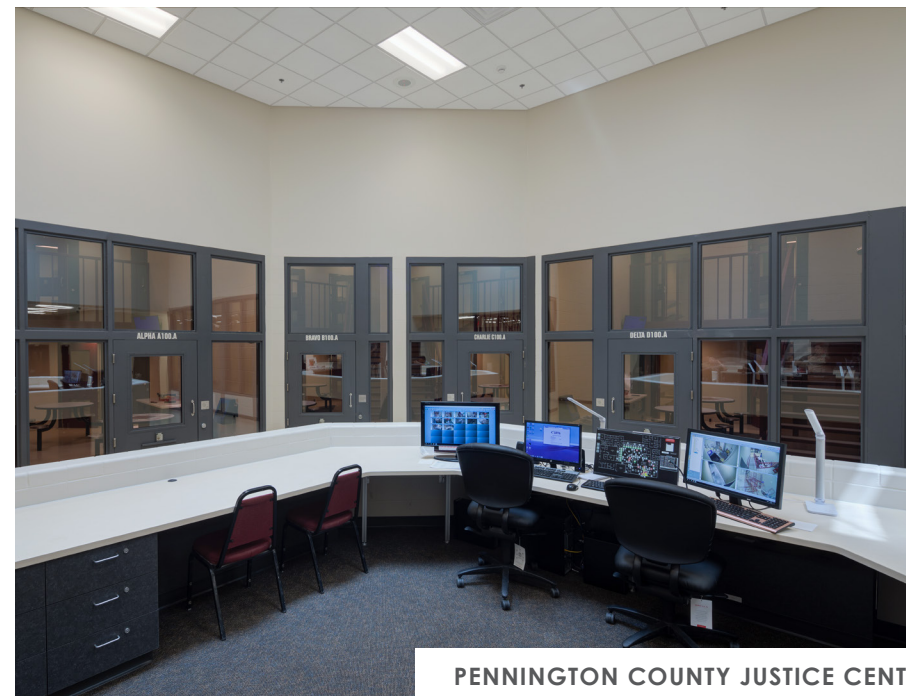
PENNINGTON COUNTY JUSTICE CENTER Thief River Falls, MN